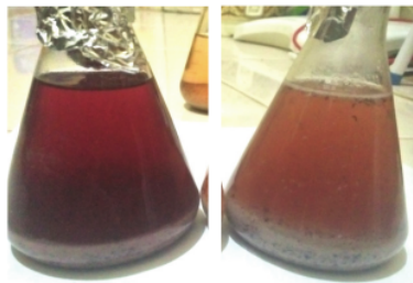
Figure 1. Color comparison of extraction process between ethanol (left) and aquadest (right).

Anthocyanin extraction of Purple Corn in this study done by using two kinds of polar solution, Ethanol mixed by HCl 1% and Aquadest. The result of anthocyanin extraction with aquadest produce the color of brownish purple, while the extraction with ethanol produces the color of thick purple.